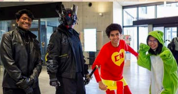
Some cuties in costume at iCLA today to celebrate Halloween!