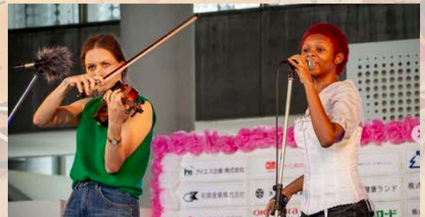
Check out photos from the fantastic musical performances by iCLA members at the Jutoku Festival!