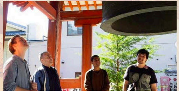
iCLA students participated in the iXperience Program to Tokoji and Zenkoji.